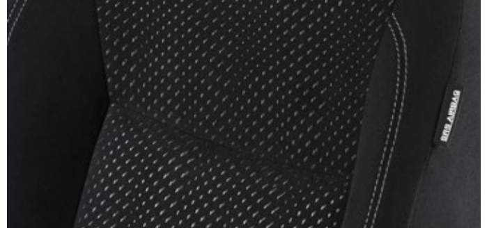
Interior Cloth seat trim.

my nissan our comprehensive ownership experience