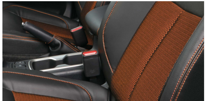
Leather/Cloth seat trim.

If the laden vehicle's mass is reduced as shown in the tables, the towball download can be increased correspondingly. Accordingly, if the laden mass of diesel variants is 410kg less than the GVM**, a towball download of 300kg is approved. Different trailer types and different trailer manufacturers have varying towball downloads. The customer will need to contact the trailer manufacturer for information as to the download. Nissan is not able to make any recommendation on the use or suitability of load-levelling or weight distribution devices to be fitted to the vehicle. Customers should contact the manufacturers of these devices for further information.